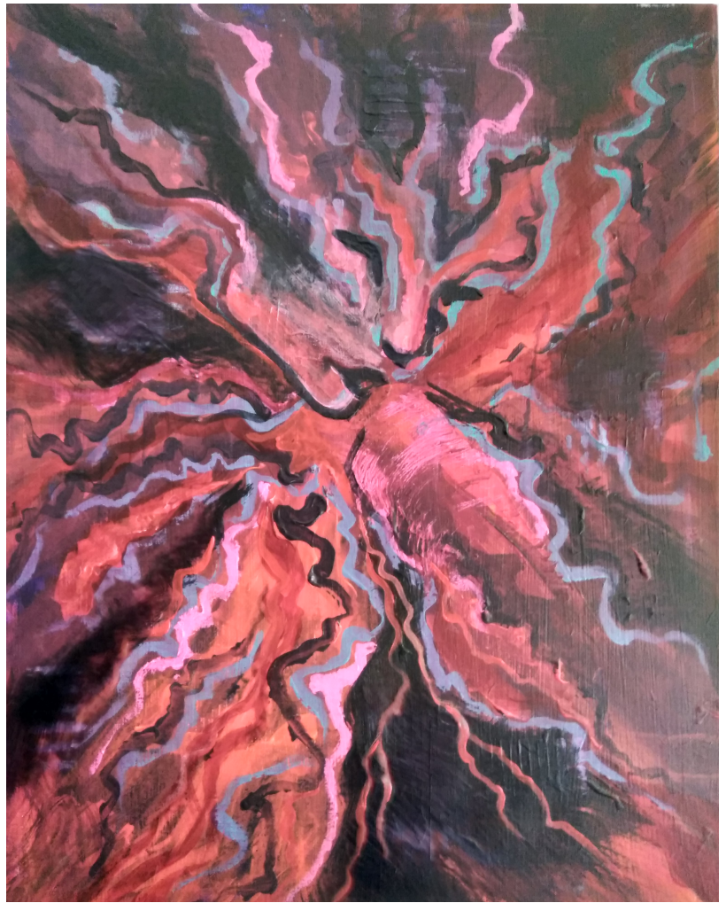
Pele, a painting by Sue Hand

But when I am not watching The mowers come